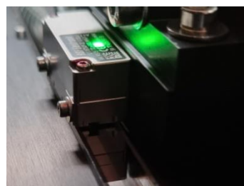
High resolution linear scale

By e-mail: info@ucamco.com On the Web: www.ucamco.com